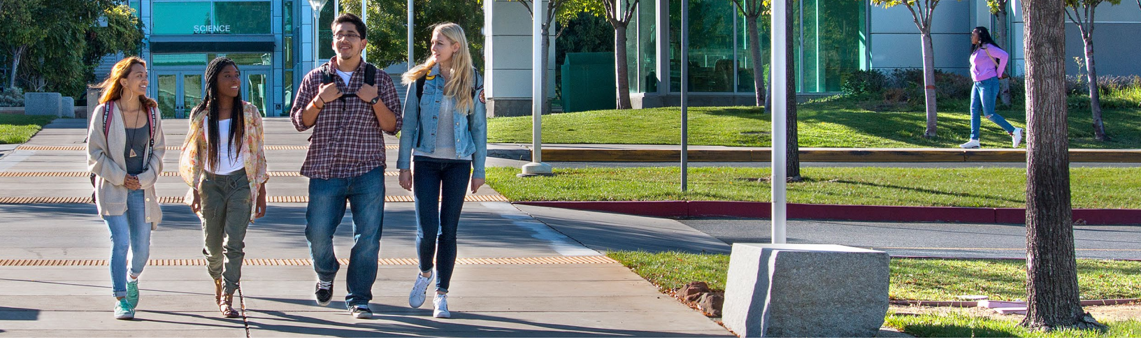
California Community Colleges